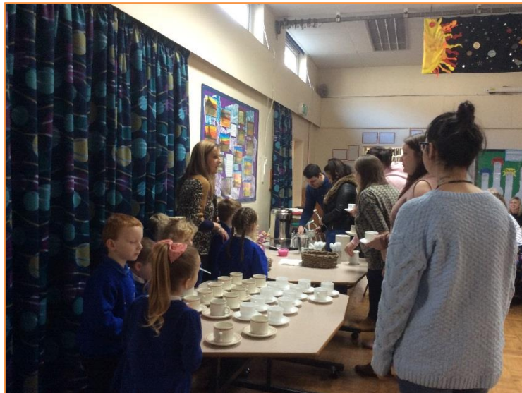
Mum's tea party hosted by Robins Class!

This week we have been thinking about mothers and writing poems about how our mums (or other family members) look after us. There is a Mothering Sunday Service on Sunday 11 th March at All Saints Church at 10.30 a.m. and the vicar has requested readers for this. We only have 2 so far, so if you are going and your child would like to read, please talk to the vicar or church wardens. Readings can be picked up from the Vicarage tomorrow. Thank you.